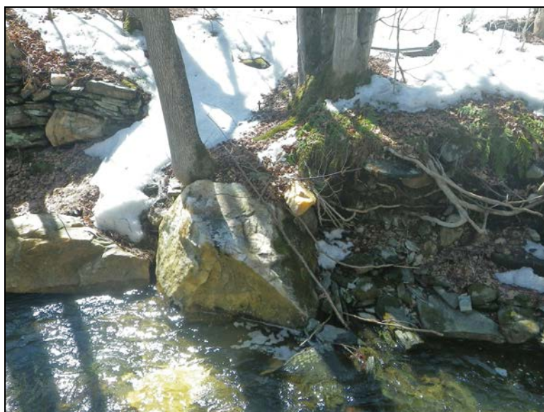
Underwood Brook, Heath, MA – April 6, 2014

Now in our fourth year of monitoring both ponds and streams, we continue to see a positive trend in ponds, which seem to be improving a little more each year. Streams show a lesser improvement, particularly for ANC, and this year, 4 streams out of 65 (6%) even showed a decrease in pH. For two years in a row now, we had a lingering snowpack and our sampling date of April 6 likely caught the snowmelt acid pulse that we try to document by sampling in early spring. It is possible that the acid pulse is more noticeable in streams than ponds due to the more rapid reaction of moving water to precipitation in streams than in ponds. This year in particular, there was a large snowpack that lasted later in the year (see photo below).